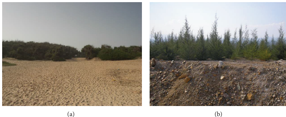
FIGURE 2: (a) Casuarina equisetifolia plantation in Niayes region for fixation of dunes, Senegal; (b) C. equisetifolia plantation in Magnesite mined out lands, India.

N content of Alnus glutinosa [61]. Alder plants inoculated with Frankia have a higher productivity, a higher shoot length, root length, dry matter production, and chlorophyll content [62]. Under nursery conditions, Frankia provides good alder plants to be used in reforestation programs [60]. Inoculation with Frankia increases the survival rate of transplanted seedlings in the field [63]. A plantation of Alnus acuminata increases soil N content by about 279 \text{ kg h}^{-1} [64]. Some other species of actinorhizal plants are also used as pioneer plants such as Coriaria and Datisca [65].