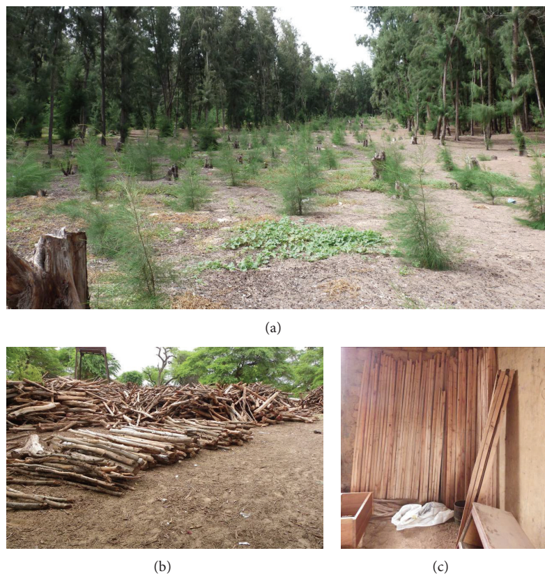
FIGURE 3: C. equisetifolia plantation in Mboro: (a) old trees are replaced by young seedlings; (b) and (c) uses of C. equisetifolia wood as firewood (b) or timber (c).

these results highlight the positive role of Frankia as an eco-friendly tool for the control of plant disease and the improvement of agricultural productivity [1].