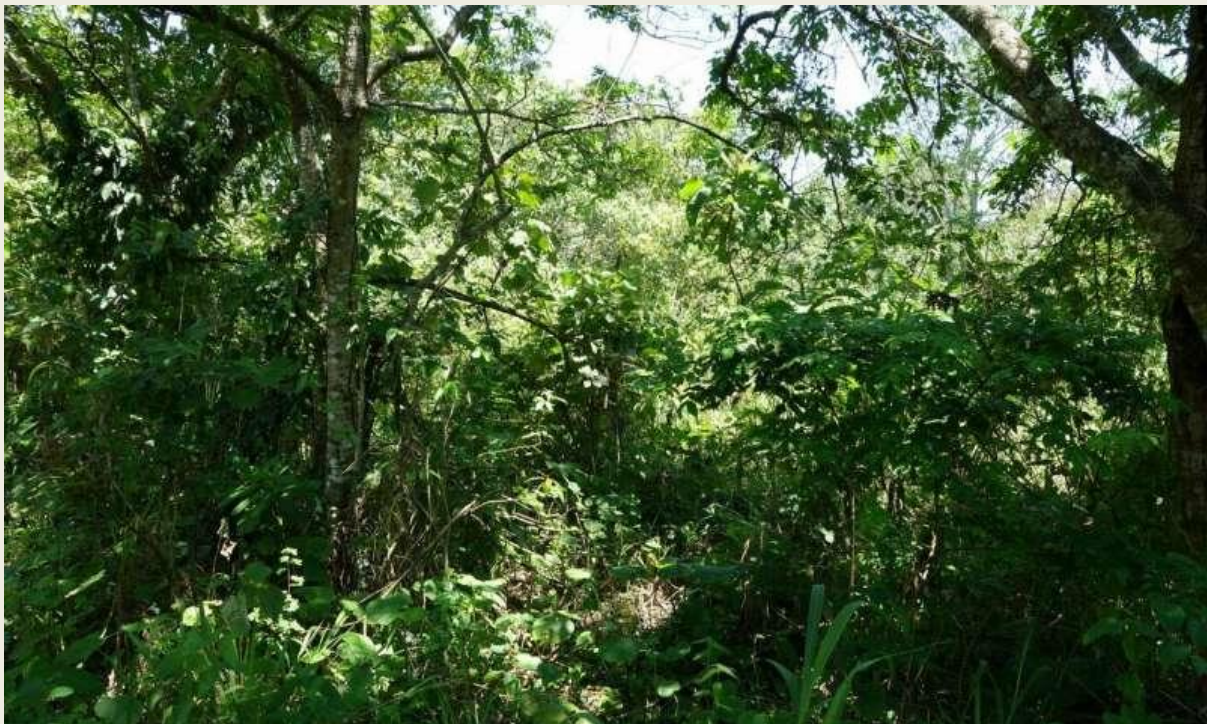
18-year-old naturally regenerating forest (exclusion of fire, some planting of native species) in Kibale National Park, Uganda. The forest supports elephants and many species of monkey after just 18 years.

The 43 tropical and sub-tropical countries—where trees grow fast—have signed up to restoration commitments, many as part of the Bonn Challenge that aims to restore 350 million hectares of forest. Together, those countries, which include Brazil, India and China, have already committed to restore 292 million hectares of forest.