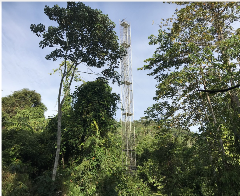
The flux tower

To measure the carbon released from the ground, researchers used a portable carbon dioxide monitor to test patches of ground and pieces of deadwood in several plots monthly for several years. The team had also set up a 52-metre-tall tower above the forest canopy to continuously measure the 'flux' of carbon into and out of the forest to see whether it was a net source or sink of carbon.